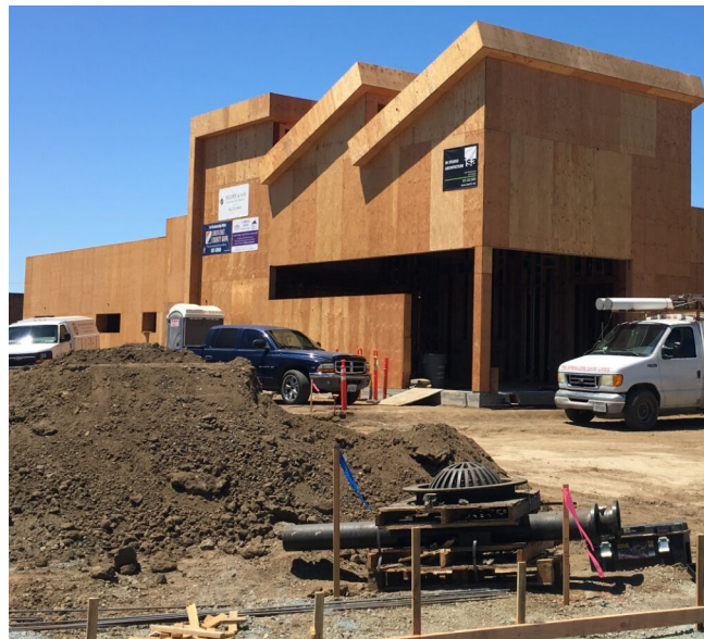
The outside of our future conference room as viewed from Brewington Avenue